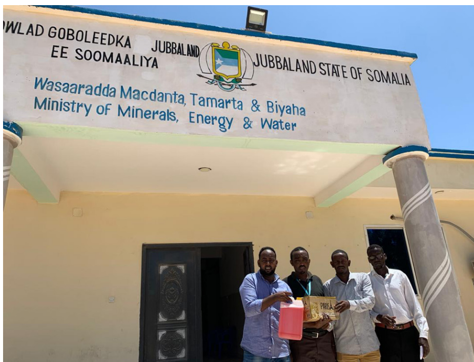
Distribution of soap and hand sanitizers to the Ministry of Minerals, Energy and Water in Jubbaland State.