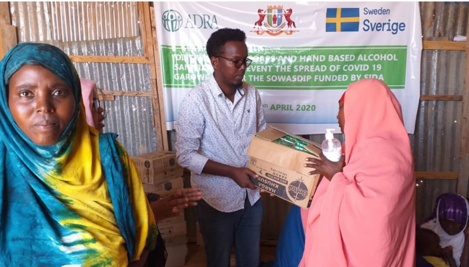
Distribution of soap and hand sanitizers to families in Internally Displaced Settlements in Garowe, Puntland.