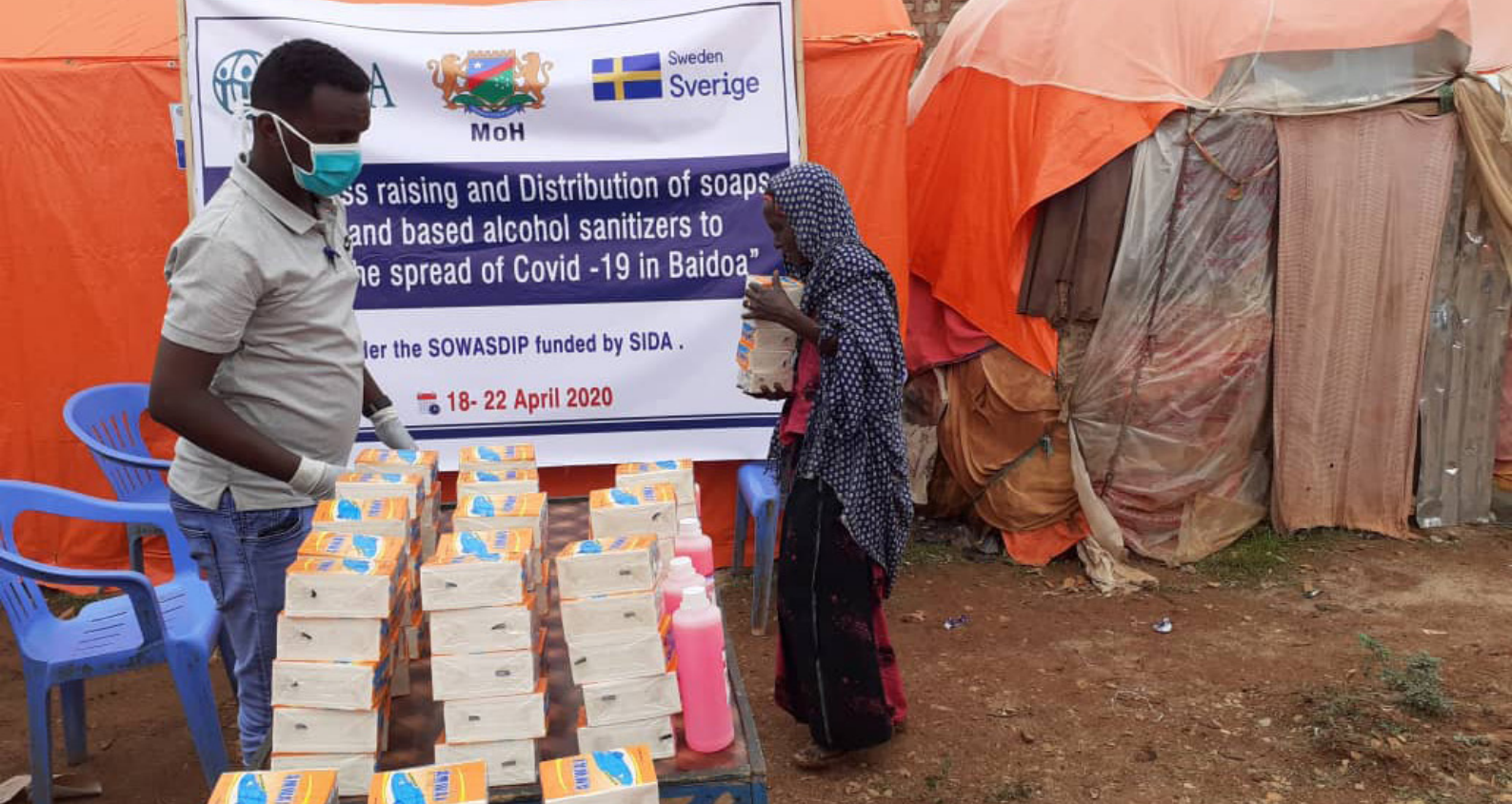
Distribution of soap and hand sanitizers to IDP camps in Baidoa during an awareness campaign for COVID-19