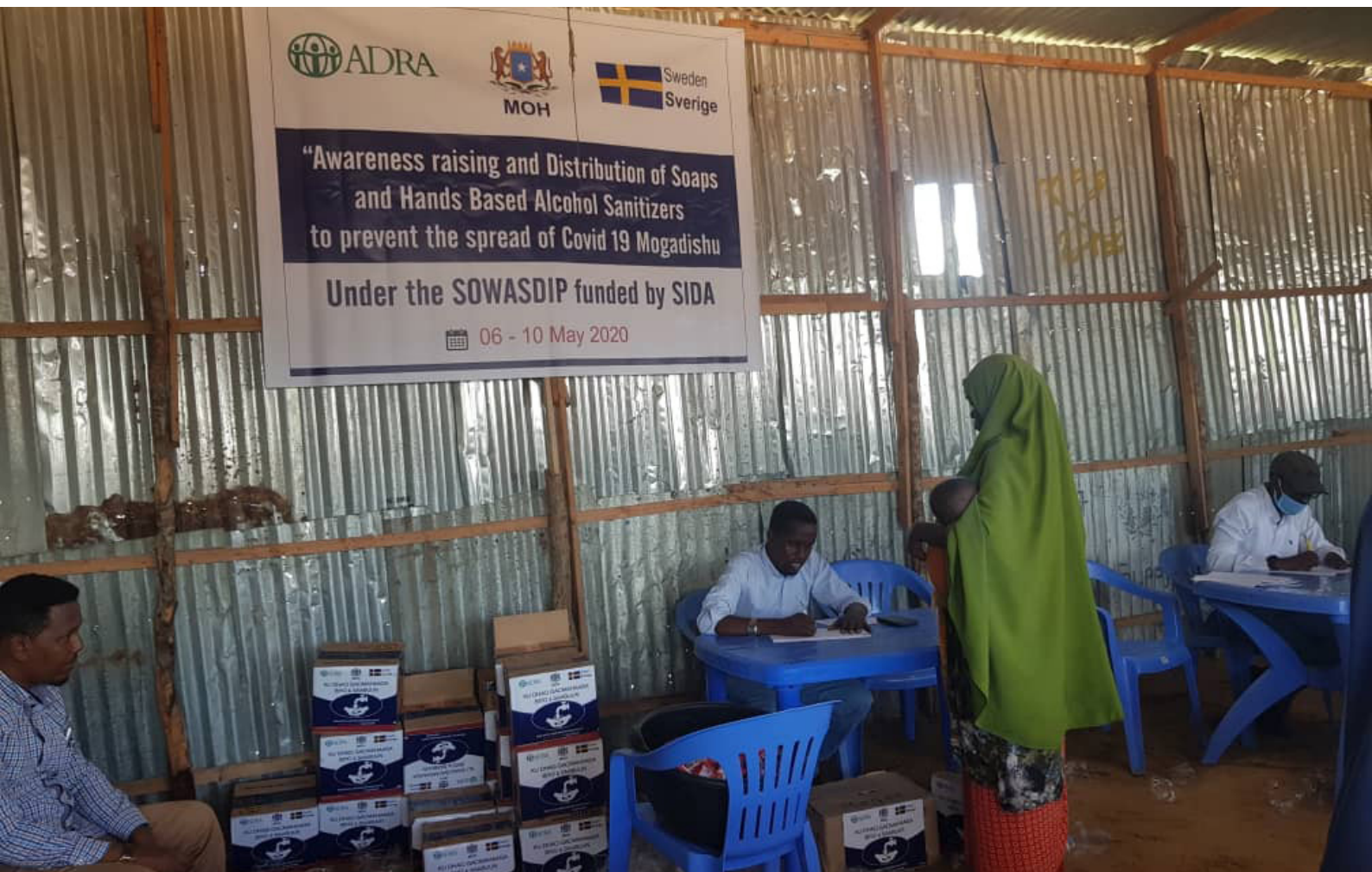
A woman picking soaps and hand sanitizers during a COVID-19 awareness campaign. The awareness and distribution were done in collaboration with Federal Ministry of Health in Daynille District, targeting 33 settlements.

ADRA will continue to work with the Federal Government of Somalia, the states and other partners to limit the spread of the virus by scaling up of preventive measures through awareness raising.