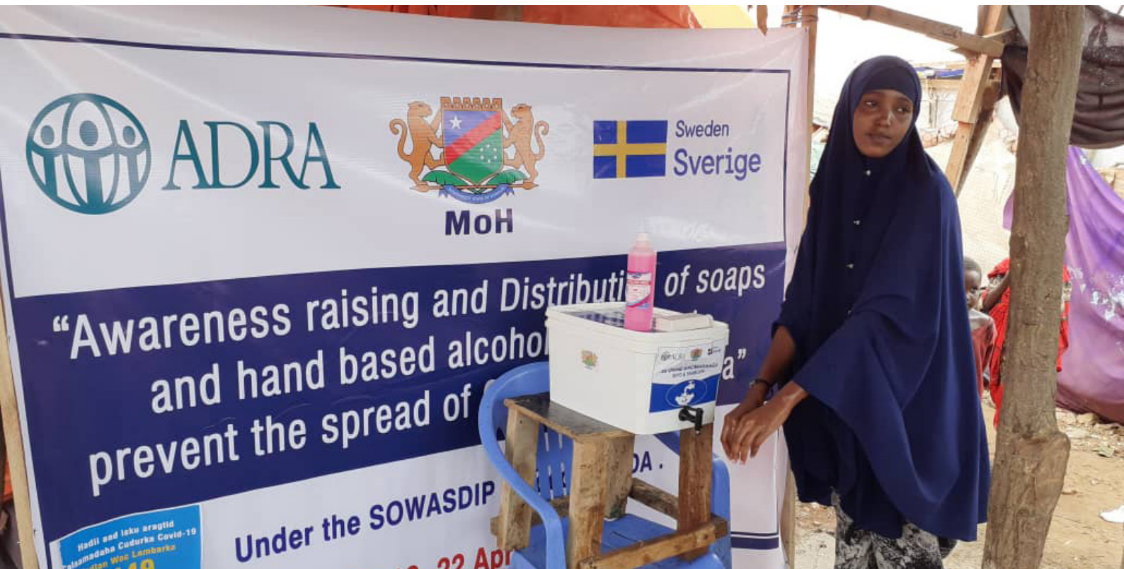
A community member washing her hands during COVID-19 awareness campaign in Baidoa.

ADRA Somalia has distributed thousands of soap and hand sanitizers to internally displaced people living in Jubbaland and Puntland states of Somalia, health facilities and government ministries.