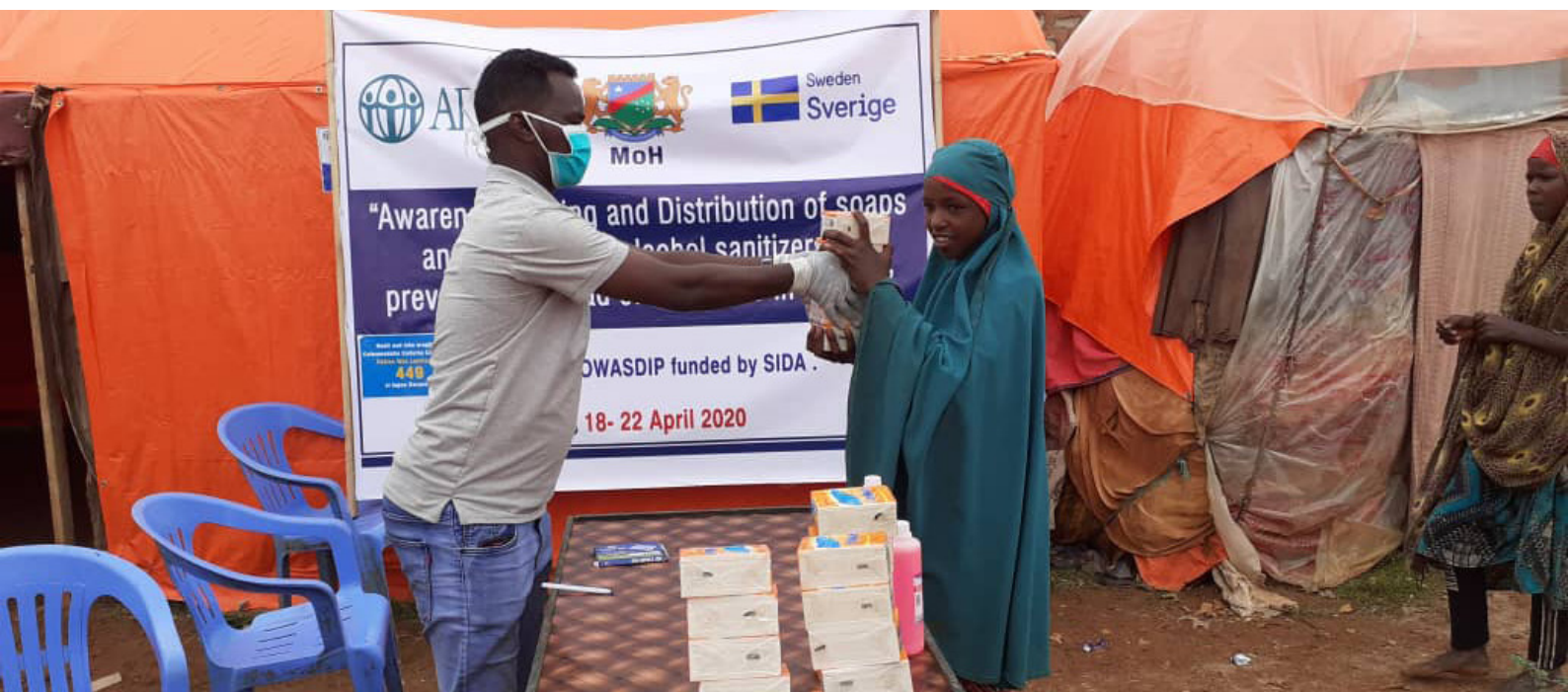
Distribution of soap and hand sanitizers to IDP camps in Baidoa during an awareness campaign for COVID-19. The distribution targeted 12,000 people in the settlement and host community.

As the country, communities and individuals strive to adjust to the new realities of the coronavirus pandemic, ADRA has also prioritized preparedness and promotion of preventive measures in support to government's efforts through the Ministry of Health.