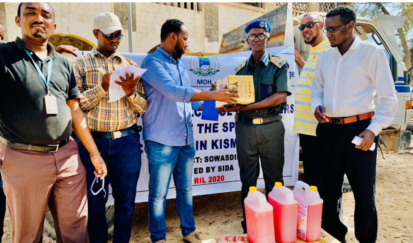
ADRA in collaboration with the Ministry of Health in Kismayo distributed 100 cartons and 100 liters hand sanitizers to 400 households in IDP camps, hospitals and MCHs.