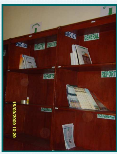
Top: Resource Centre Custodians label book shelves & (above) Some of the books shelved at the Resource Centre