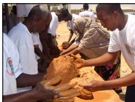
Training of Cookstove Producers in Hargeisa, Somaliland

The producers require further training in business and entrepreneurship in order to be able to engage in the business for the long term. Such training would enable them to develop production plans, set targets that would be appropriate for internal control and evaluation, begin saving scheme, keeping proper records and accounts.