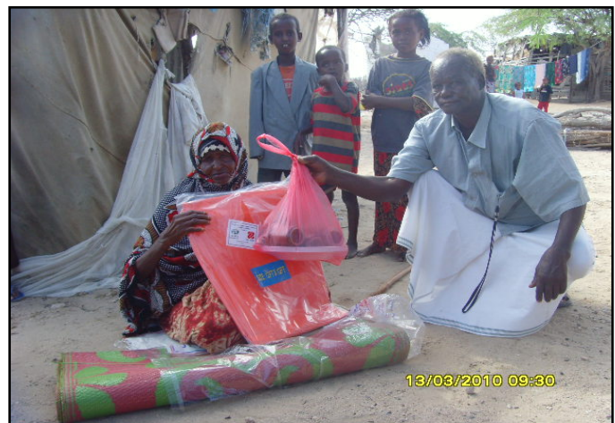
Top: Assessment of a borehole in Faradero and (above) distribution of Non Food Items to IDPs at Wadajir Camp