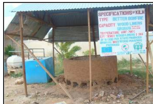
One of the kilns constructed for Cookstove Producers in Hargeisa, Somaliland