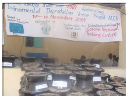
Cookstoves on Sale during the Garowe Energy Trade Fair 2009