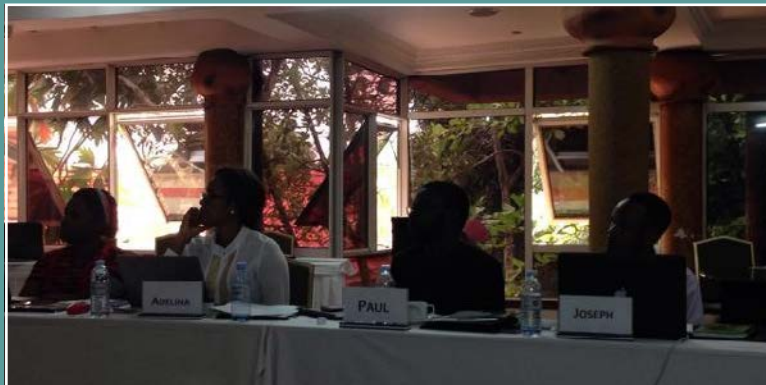
African Writers annual book writing training in Uganda in October of 2015

PWWA participates in the African Writers annual book writing training in Uganda organised by FEMrite Ugandan Women Writers Association